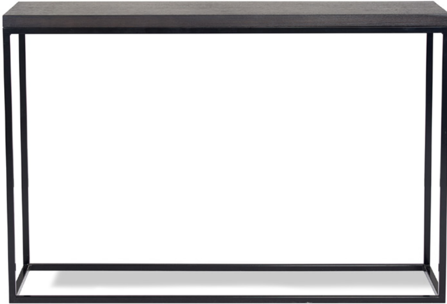
Frame 1200L Console.