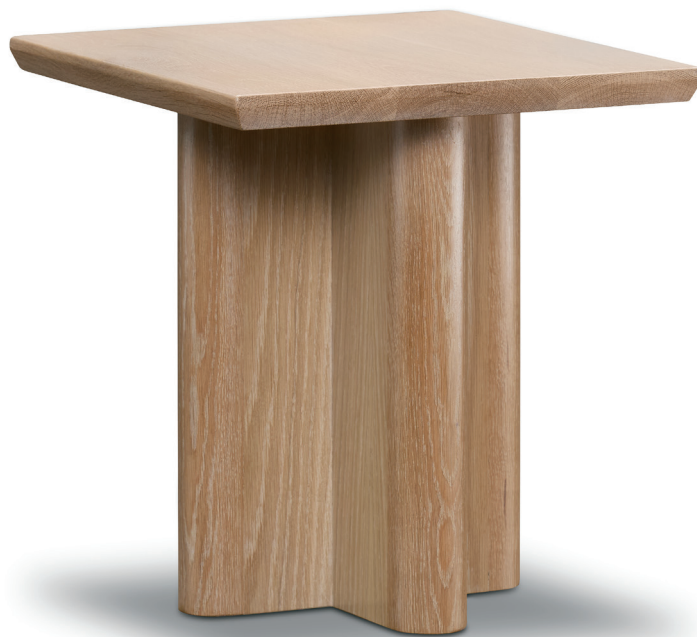
Clover Side Table (Square)